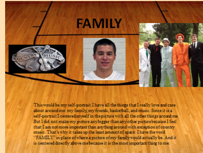
This would be my self-portrait. I have all the things that I really love and care about around me: my family, my friends, basketball, and music. Since it is a self-portrait I centered myself in the picture with all the other things around me. But I did not make my picture any bigger than any other picture because I feel that I am not more important than anything around with exception of country music. That's why it takes up the least amount of space. I have the word "FAMILY" in place of where a picture of my family would actually be. And it is centered directly above me because it is the most important thing to me.