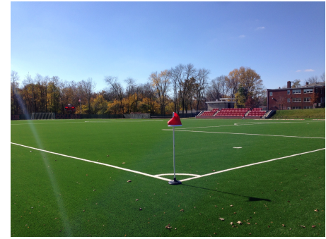
While scrolling through some photographs this is the one I feel that expresses me the most. This is an image of the Wabash College soccer stadium from a corner.