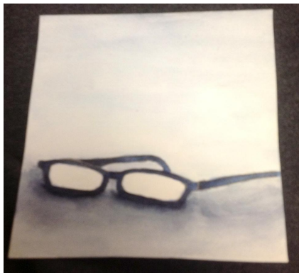
All we are, are the Memories we make. The Stories we impart. The Gifts we give. When we are gone, that is all we will ever be. (Korbin West)