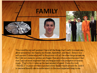
This would be my self-portrait. I have all the things that I really love and care about around me: my family, my friends, basketball, and music. Since it is a self-portrait I centered myself in the picture with all the other things around me. But I did not make my picture any bigger than any other picture because I feel that I am not more important than anything around with exception of country music. That's why it takes up the least amount of space. I have the word "FAMILY" in place of where a picture of my family would actually be. And it is centered directly above me because it is the most important thing to me.