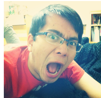
One cannot know you until they see the other (embarrassing) side of you. (Kun Tran)