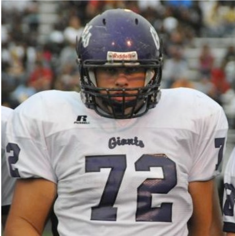
Any Given Friday.